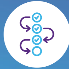
Action and Improvement Plans