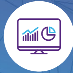
Analytics and Reporting