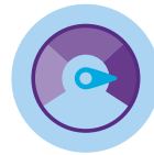
Analytics and Reporting