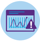
Incident and Event Management