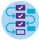
Action and Improvement Plans