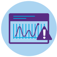
Incident and Event Management